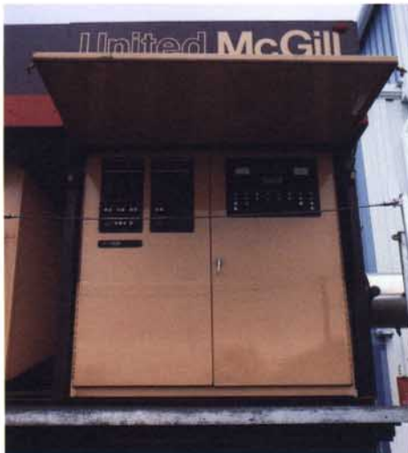
Microprocessor-based controls for the mobile EP are equivalent to those used on full-scale units.