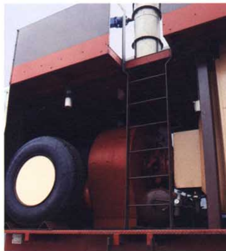
Remotely controlled, the fan and damper system allows the EP to draw varying volumes of flue gas.