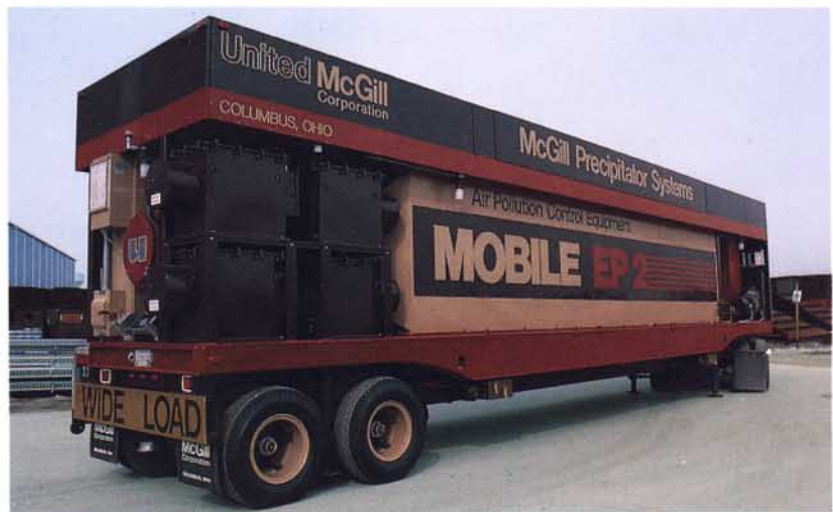
The mobile EP is packed up and ready for its next job.