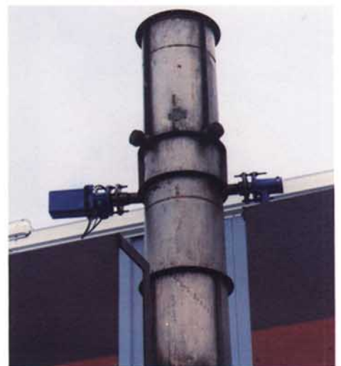
The outlet stack's opacity monitor (blue) indicates plume reduction; test ports for EPA Method 5 testing are above.